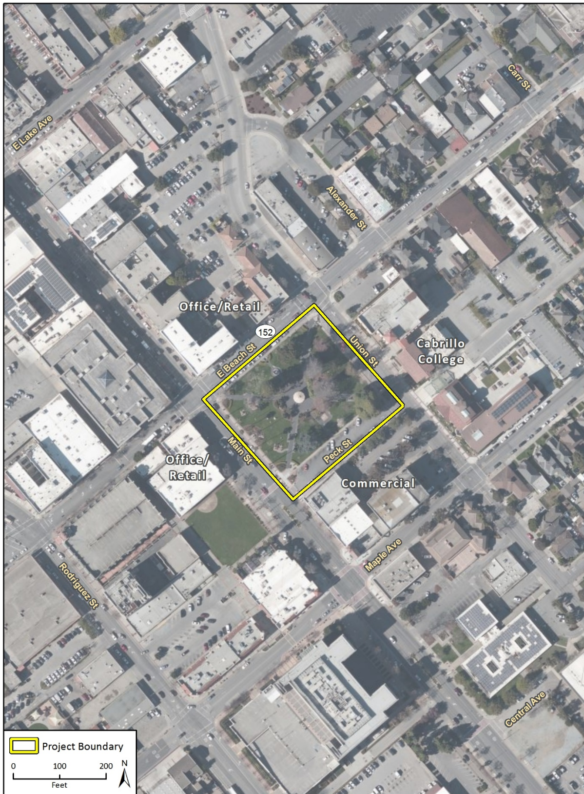
Figure 2 Project Location