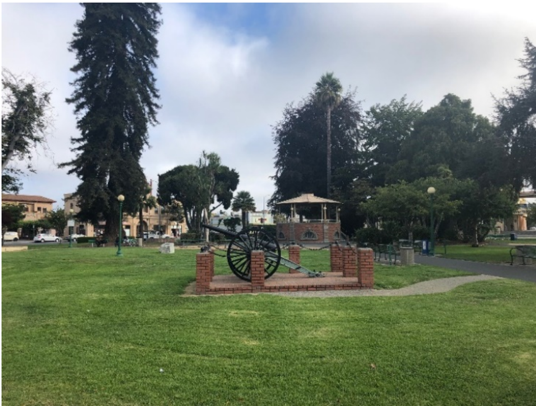
Photograph 3. Cannon monument located at southeast portion of the plaza, facing north