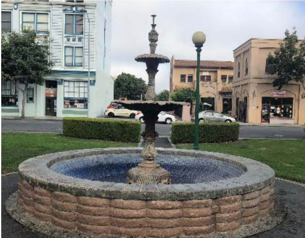
Photograph 2. Fountain located at western portion of plaza, facing west