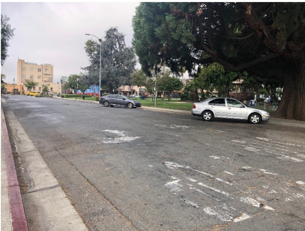
Photograph 4. View of Peck Street and plaza from the east