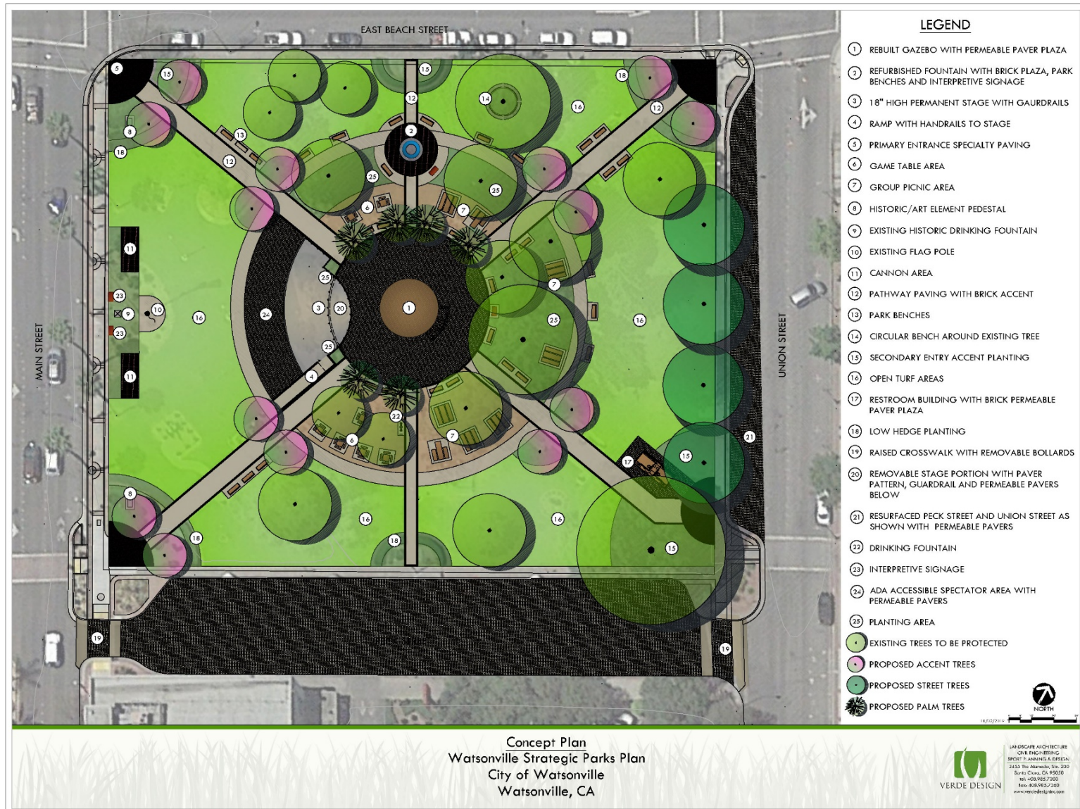
Figure 4 Watsonville City Plaza Conceptual Plan