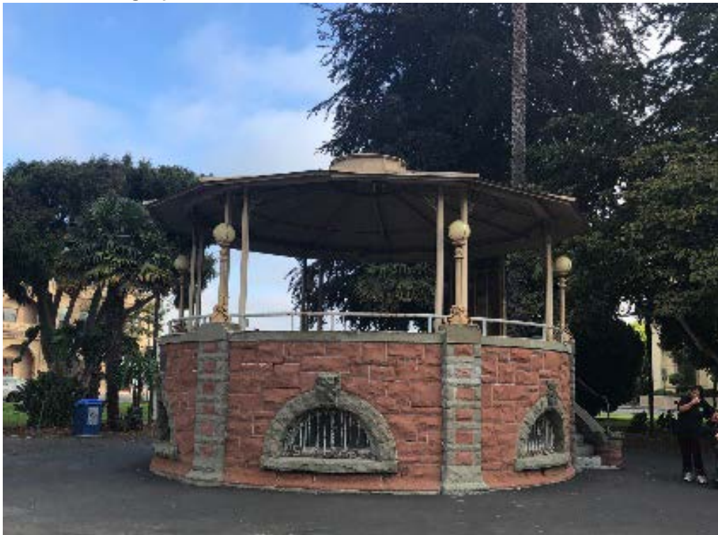
Photograph 1. Gazebo, facing northeast