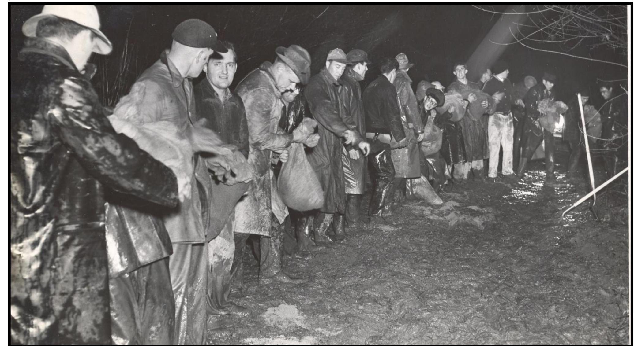
Volunteer workers on the Pajaro River Levee 12/23/55