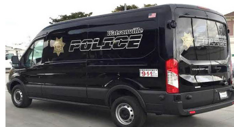
New WPD Transport Van

During Fiscal Year 2016-2017, the Police Department purchased two K-9 patrol vehicles, two unmarked police vehicles, one patrol vehicle and one transport van. The transport van helps officers spend more time patrolling the community and less time transporting persons in custody to the County Jail in Santa Cruz. In the past, officers needed to make multiple trips to the jail to transport persons due to limited space in the patrol vehicles. The new transport van is safe, reliable and has more passenger space. A total of $254,685 was used to purchase the five police vehicles and the transport van.