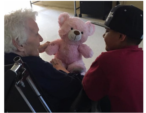
PAL youth participating in community service at the local Senior Center

PAL continues to provide youth prevention programs, such as Lego Robotics that gives youth an opportunity to build, create, and use computer software to move the robots in predesignated movements. The youth worked in pairs and applied teamwork, problem solving, and creative skills throughout the session. PAL also incorporated community service at the Senior Center; the youth interacted with seniors during recreation time that included art, karaoke, and movies. The youth were able to listen to stories about the senior's childhood, provide companionship, and give the seniors an opportunity to hear about current trends. PAL also partnered with the Teen Kitchen Project to provide prepared meals for individuals living with life-threatening illnesses. PAL started a Homework Club, which provides youth of all ages with a safe and supportive learning space to receive help with their academics. During FY 2016-2017, $158,112 of Measure G funds was used to support the Police Activities League Program.