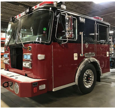
Fire engine during mid-production inspection January 2018.